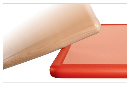
• MA2 No-Drip Profile PURTech® Edge

• Urethane edges are easy to clean; hot water and soap is all that is needed for most applications, but stronger cleaners such as Formula 409<sup>®</sup> or Clorox<sup>®</sup> Clean-up<sup>®</sup> Cleaner+Bleach are also suitable.