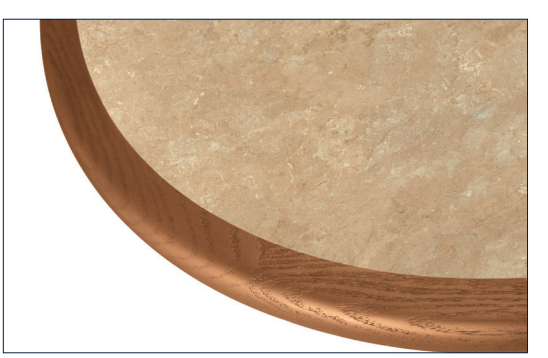
• MP1 Bullnose Profile PURWood® Edge