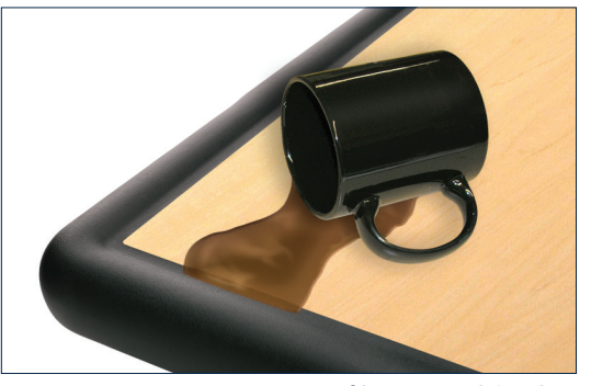
MA2 No-Drip Profile PURTech<sup>®</sup> Edge